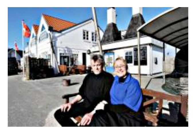
Det Gamle Røgeri i Vejers The Old Smokehouse in Vejers